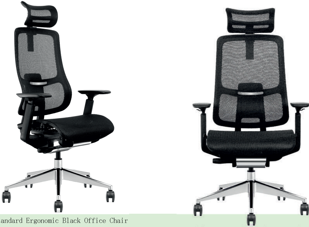
BIFMA Standard Ergonomic Black Office Chair

Headrest: Large size headrest design, height adjustable, suitable for people of different heights, to achieve the most effective support and make the neck healthier.